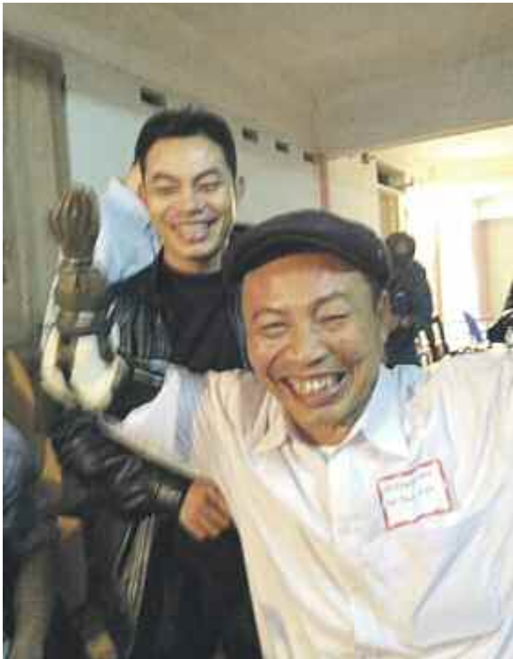
Recipients celebrate new hand tools.

“Their smiles were a reward we will always treasure,” she adds. “And Rotarians will be back.”